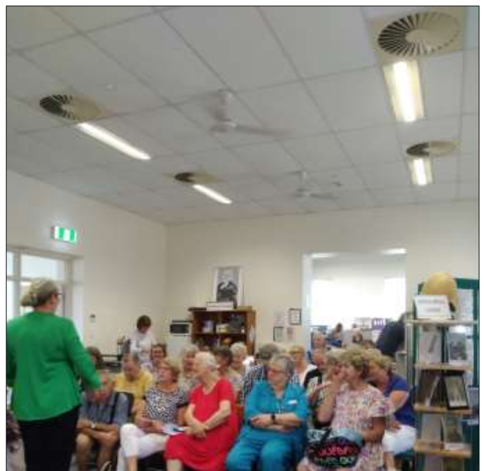
A Full House! PFFF Guest Speaker & General Meeting - February 2025.