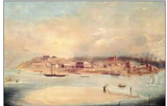
Port Macquarie c1820