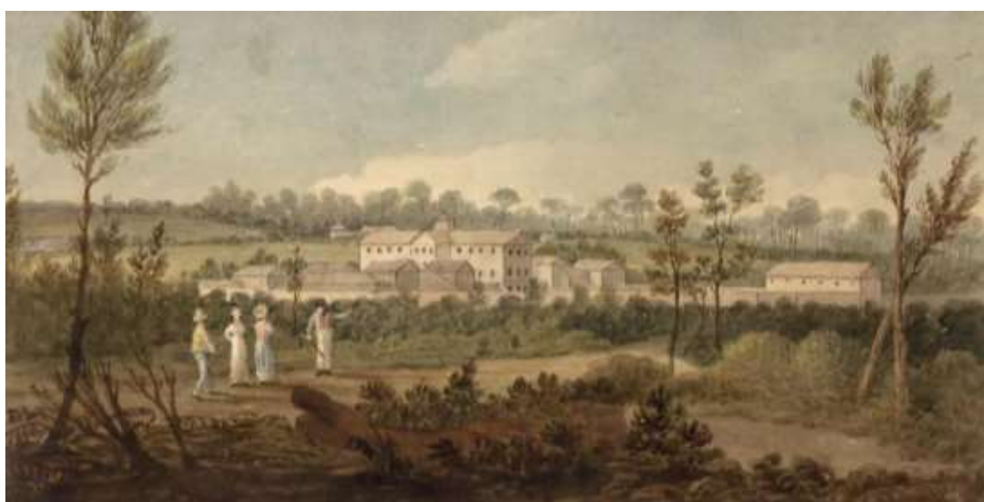
The Parramatta Female Factory - Augustus Earle 1826