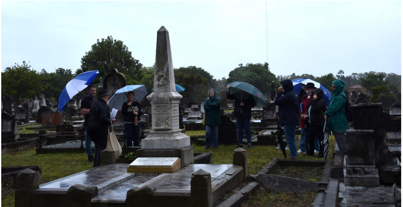
A volunteer tells the story of her grandparents' grave to a tour group