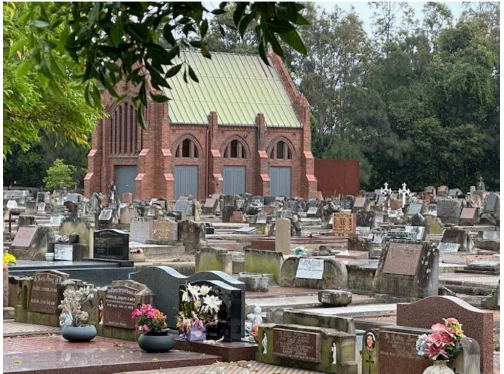
The newly restored Catholic chapel