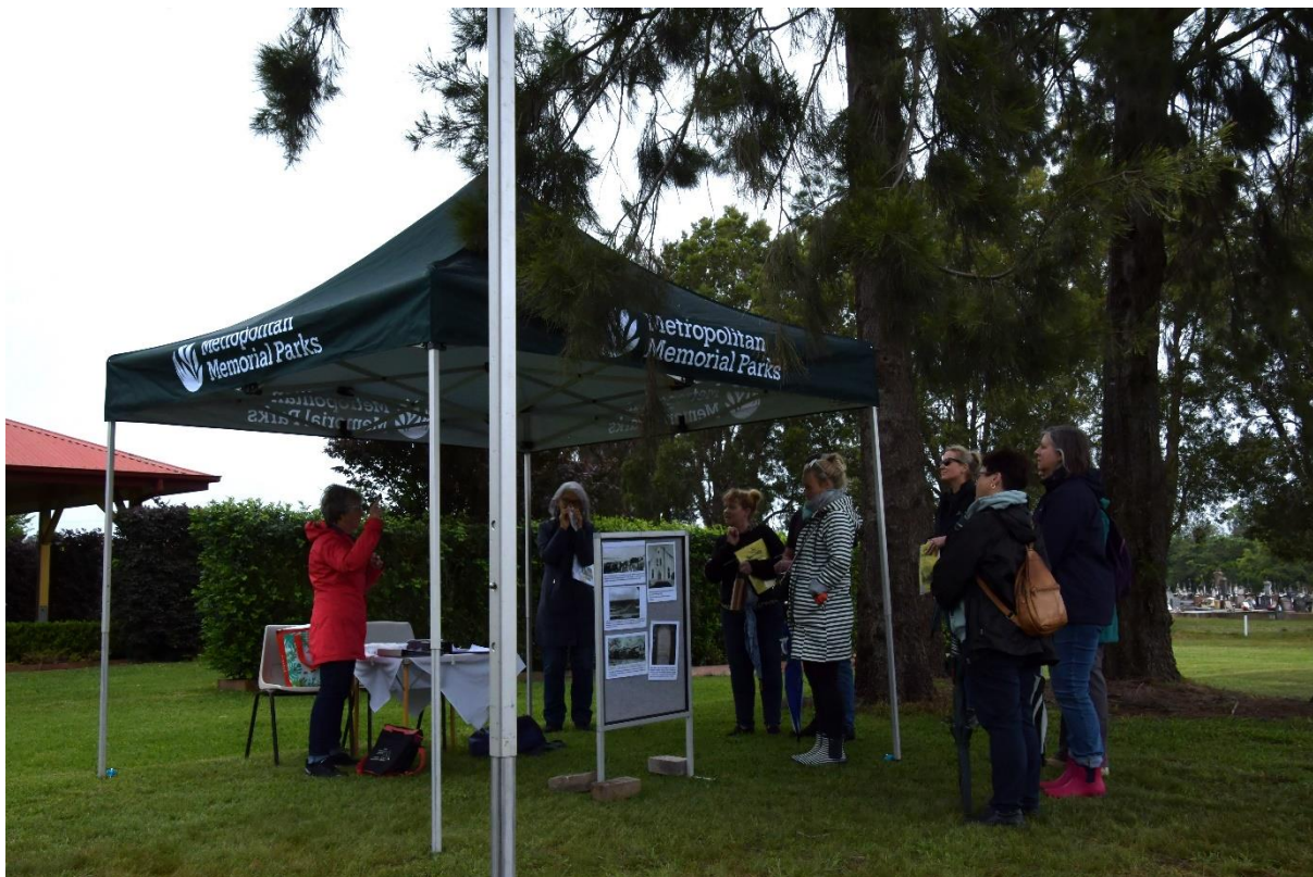
A volunteer explains the photo board to some members of a tour group