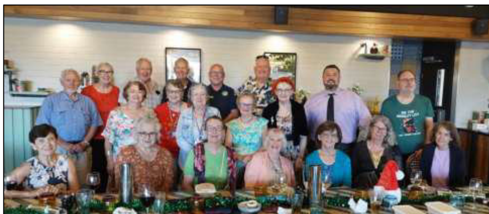
Christmas Lunch at the Parramatta Leagues Club, our generous sponsors in 2024: PFFF Committee, Researchers, Catering Team, Guides, spouses and PLC CEO , President and Board rep.