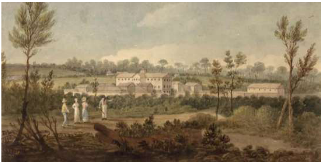
The Parramatta Female Factory - Augustus Earle 1826