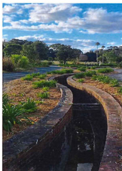
Serpentine canal and borders following clean out by RGC grounds team