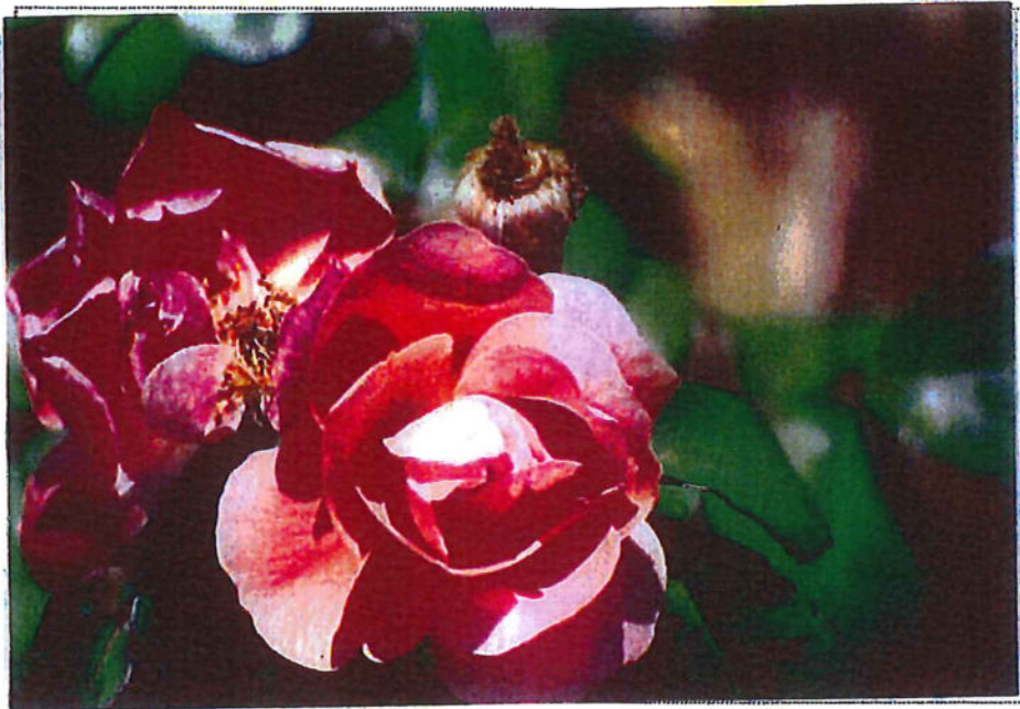
One of the hundreds of old rose varieties found at Rookwood. This is thought to be Lorraine Lee, an Australian bred Allstaire Clarke rose.

For rose enthusiasts Rookwood is a wonderland of sometimes hidden and often mysterious treasures.