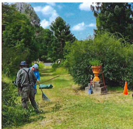
Laurie & Luke tidying up at BB Rose garden