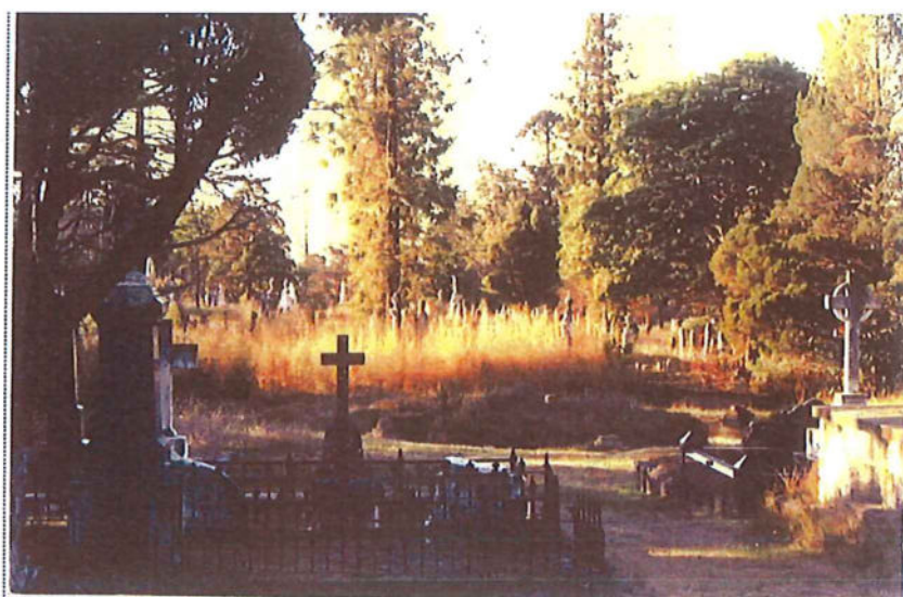
The peace and tranquillity of the historic No1 Anglican cemetery at Rookwood.