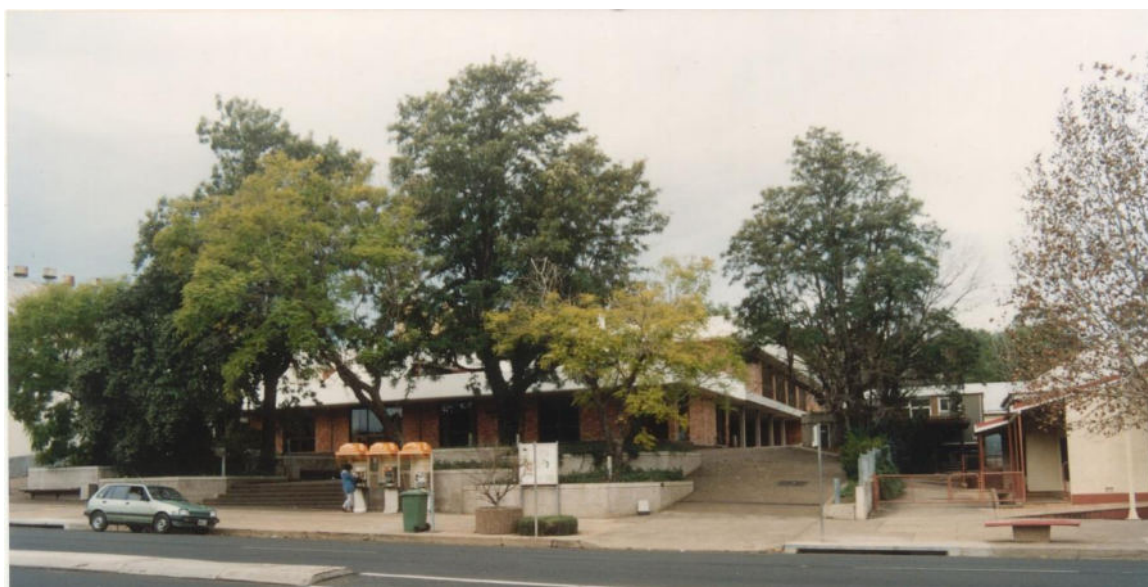
New Court House 2018, Muswellbrook Society Photo 2277.12

During the past week there has been much activity on the site of Muswellbrook new $1.5 m Court House, when the removal of some 4 000 metres of soil has been in progress. Photo and words Muswellbrook Chronicle 10 April 1979 page 8