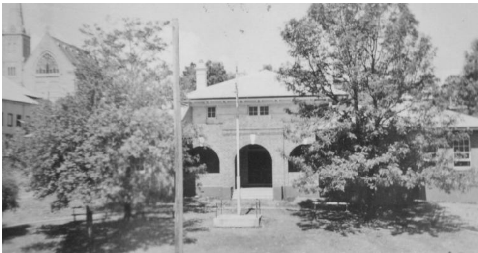
Muswellbrook Society Photo 0734

Muswellbrook Chronicle Wednesday 27 April 1904