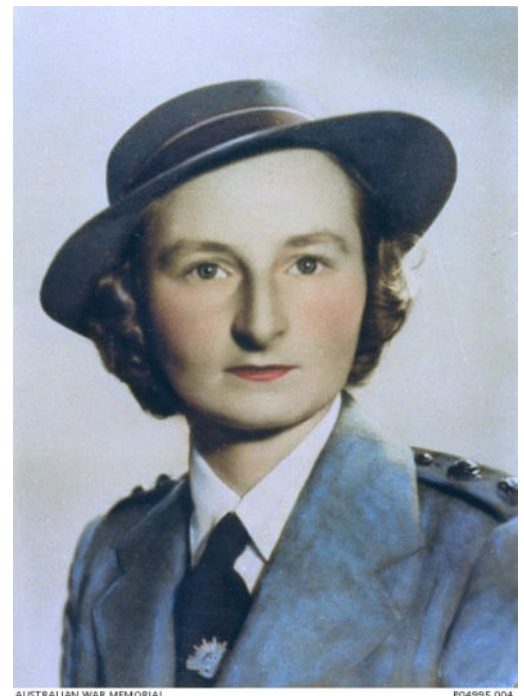
AUSTRALIAN WAR MEMORIAL

"We lived in huts and most of the hospital wards were tents, although each ward had one large shed as one arm of the cross, the kitchen was in the centre and three large marquees completed the complex.