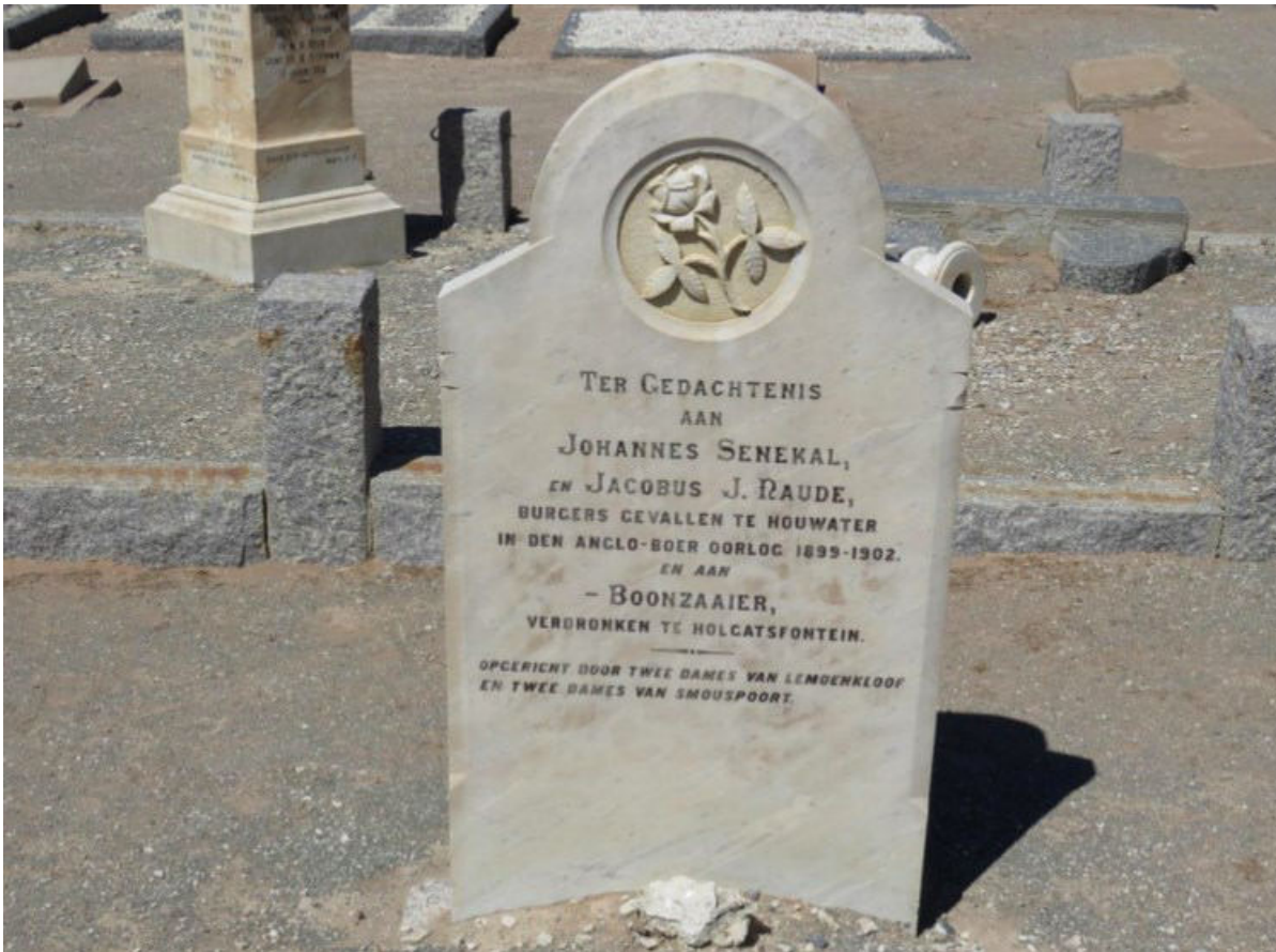
Memorial tombstone to three burgers who fell during the Anglo Boer War (SJ de Klerk)

Grobler J. (2018). Anglo Boer War (South African War) 1899 – 1902 . Historical Guide to Monument and Sites in South Africa. 30° South Publishers, Pinetown.