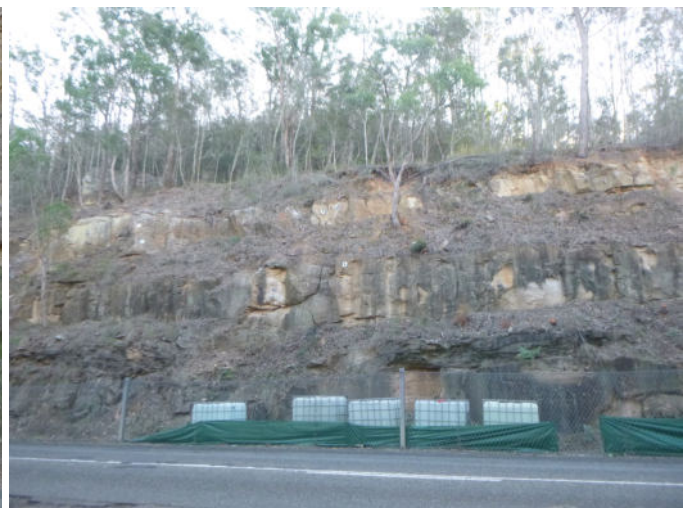
An area of rock stabilisation.