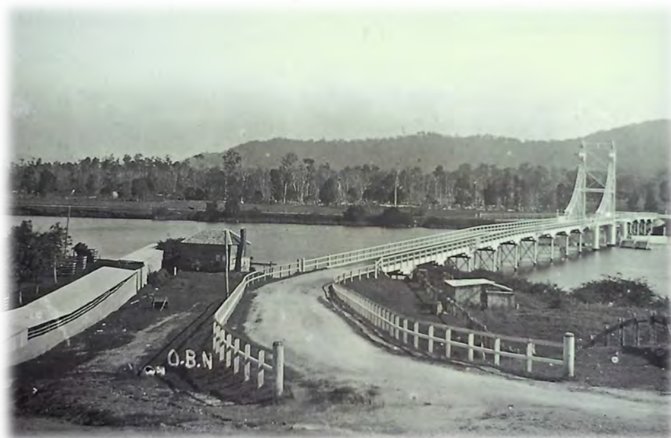
McFarlane Bridge Approach