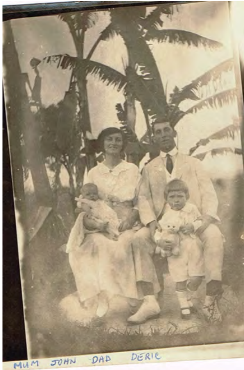
This photo was taken at Maclean in 1918.

the hospital cow has gone dry, and supplies of milk daily, would be very gratefully received....”