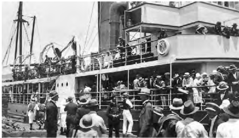
SS Pulganbar at Maclean Wharf https://shippingtandy.com/wp-content/uploads/sites/2/2020/11/3

The Howards arrived by the SS Pulganbar on 8 June 1916 and were "tendered a welcome by the aboriginals(sic) who erected an arch on the landing stage, over which floated the Union Jack." Grafton Argus , 9 June 1916