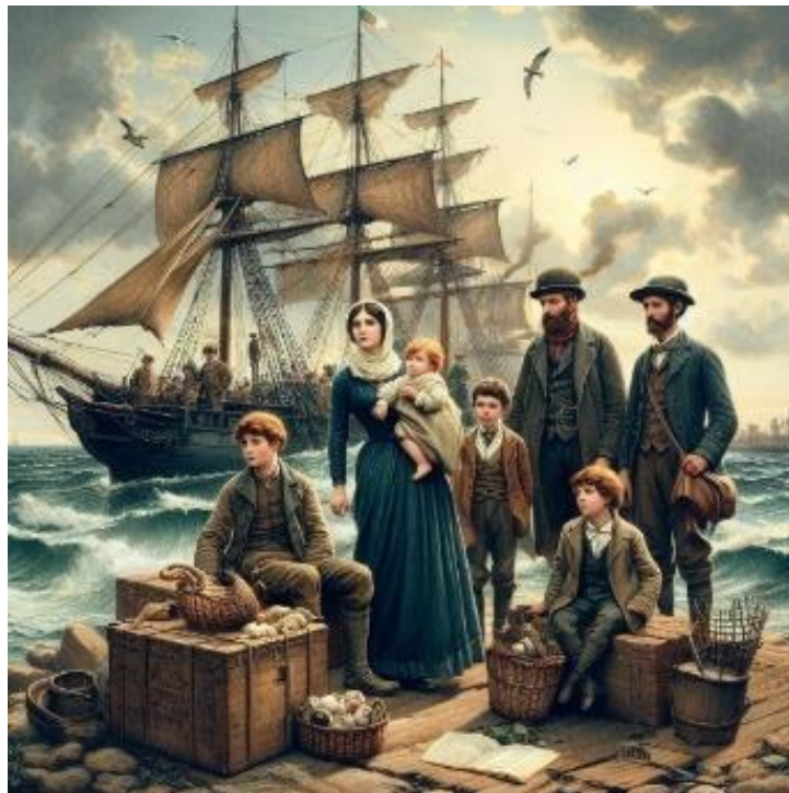
An immigrant Irish family generated by artificial intelligence via Bing Image Creator which was asked to depict Irish immigrants arriving in Sydney in the 19th century.

If you are a member of a family history society that has affiliate membership to the SAG please use the discount code available from your society to access this discounted event registration.