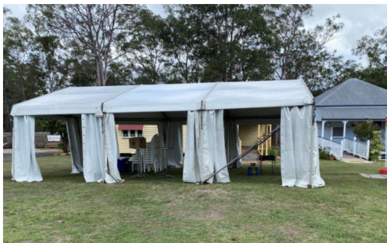
Before the Event

Skate Synergy Roller Sports Club Bundamba – To cover the cost of insurance and subsidise 24 weeks of training with an accredited coach who will volunteer his time. $ 5,000