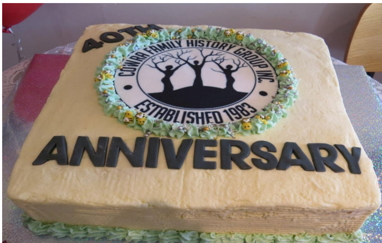
Our 40th Anniversary Cake