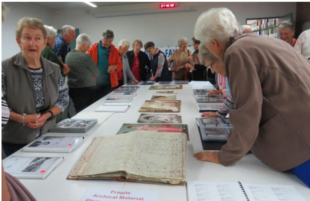
Cowra Probus members studying items in our Pardey display