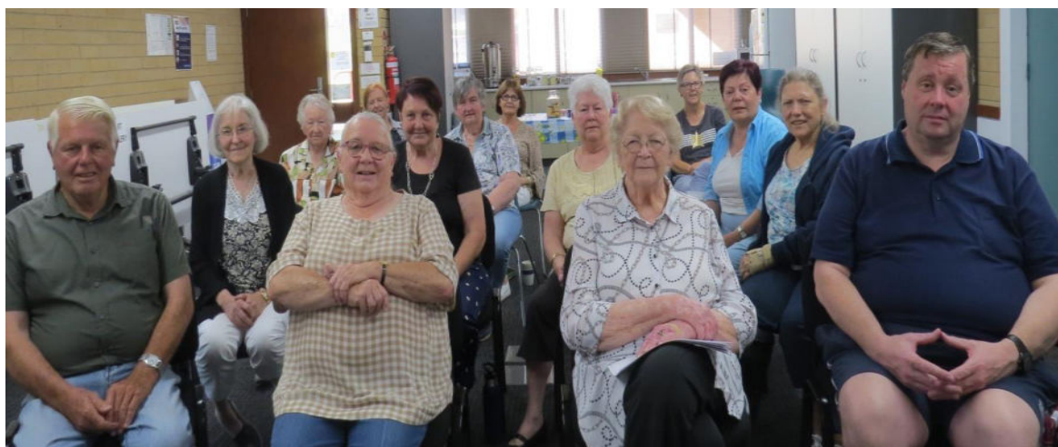
Cowra Family History Group members at our AGM held on 4 th Nov. 2023

Thank you all for making my job pleasant and enjoyable.