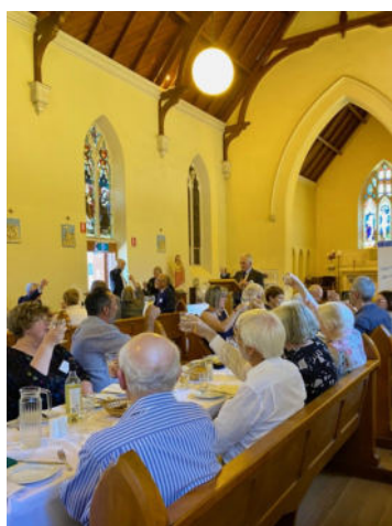
MEMBERS AND GUESTS AT THE LUNCHEON IN LOVAT CHAPEL

MEMBERS TURNED OUT IN FORCE TO TAKE PART IN THE CHRISTMAS STREET PARADE LAST WEEK. IT WAS A NOD TO THE 1960S THE DECADE WHEN THE SOCIETY WAS FORMED. HIPPIES, BEATLES, DECIMAL CURRENCY AND EVEN AN ASTRONAUT MADE AN APPEARANCE.