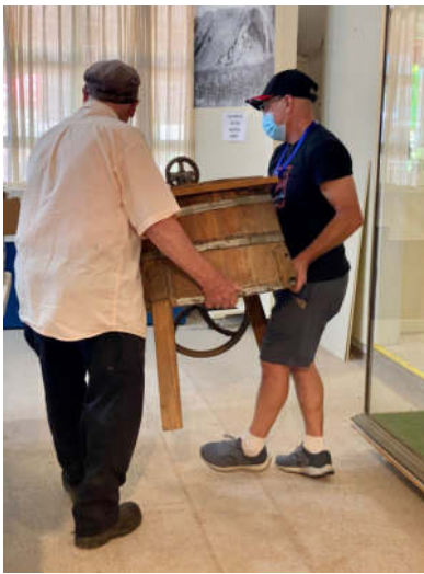
THE WOODEN WASHING MACHINE MAKING ITS WAY TO A NEW HOME.