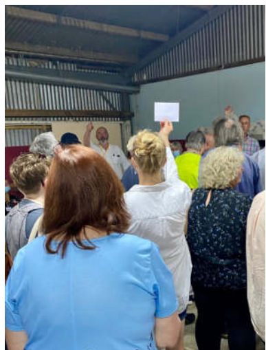
BIDDING WAS CONDUCTED AT A BRISK PACE TO GET THROUGH THE LOTS. [SHEREE BAMFORTH]