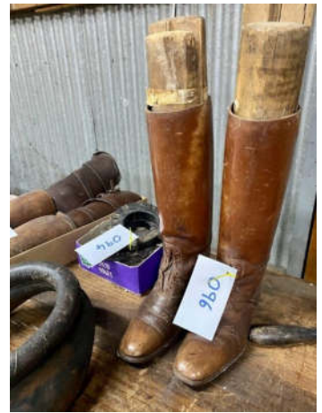
BOOTS AND LEATHER ITEMS ARE TO GO TO AUCTION ON 18 NOVEMBER. [JUDITH DAVIDSON]

It was clear from those who attended that when families and locations are mentioned in presentations that descendants and neighbours find these of interest. Our archive volunteers were happy to assist Cameron with images and information for the book, which has grown somewhat larger than originally intended and we look forward to its release in the near future.