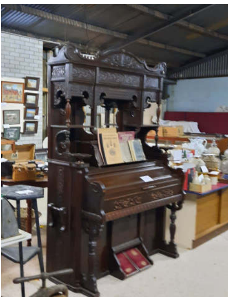
READY TO BE A UNIQUE ADDITION TO YOUR HOME. [CHERYL MONGAN]