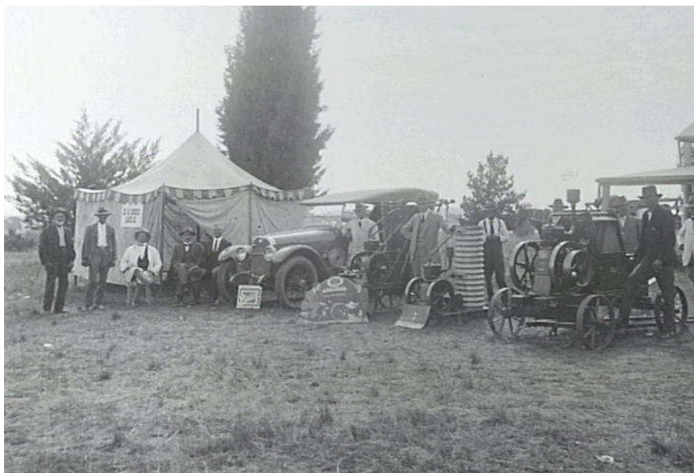
FORERUNNER TO THE YASS ANTIQUE FARM MACHINERY CLUB? E.O. MOORE & CO WHOSE NAME APPEARS ON THE TENT WERE ADVERTISING MOTOR VEHICLES IN YASS WAY BACK IN 1915. (YDHS ARCHIVES)