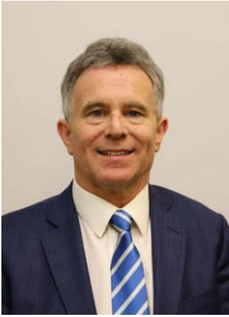
IRISHMAN SEAN FLEMING TD, MINISTER OF STATE FOR FOREIGN AFFAIRS WILL BE OUR GUEST AT OUR END OF YEAR GATHERING ON 6 DECEMBER