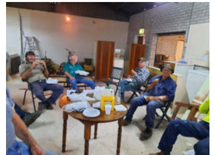
MEMBERS OF THE YASS ANTIQUE FARM MACHINERY CLUB ENJOYING A WELL EARNED LUNCH AFTER REMOVING THE INTERNAL DISPLAY PARTITIONS AT THE MUSEUM.