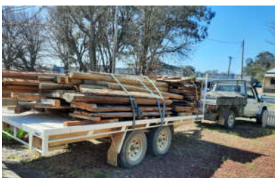
THE SHEARING SHED FLAT PACKED AND READY TO HAVE A NEW LIFE WITH THE YASS ANTIQUE FARM MACHINERY CLUB.