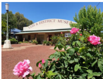
HARD DECISIONS CONCERNING THE MUSEUM BUILDING WILL HAVE TO BE MADE IN THE NEAR FUTURE.