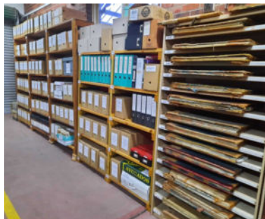
PART OF THE ARCHIVAL COLLECTION TO BE REHOUSED BY JUNE 2024. [CHERYL MONGAN]