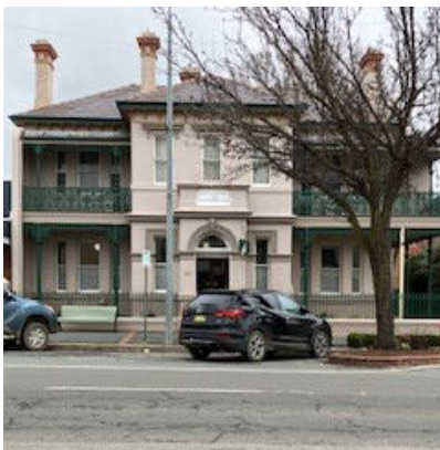
THE STATE BANK CEASED OPERATION PRIOR TO THE SALE OF THE BUILDING IN 1988. [MAUREEN COLLINS]