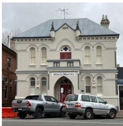
THE FRESHLY REPAINTED MECHANICS' INSTITUTE WAS BUILT IN 1869. [MAUREEN COLLINS]