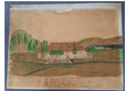
A SIMPLE WATERCOLOUR OF A MODEST RURAL DWELLING REVEALS A STORY OF RELOCATION AND HARD RURAL LIFE. [CHERYL MONGAN]