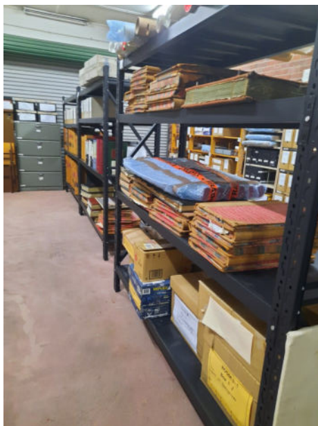
ANOTHER PART OF THE ARCHIVAL COLLECTION TO BE REHOUSED BY JUNE 2024 AND STILL MORE TO COME! [CHERYL MONGAN]

Yass & District Historical Society Inc is affiliated with the Museums Australia & Royal Australian Historical Society