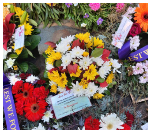
OUR ANZAC DAY TRIBUTE.

June 4 Museum 10am-4pm June 5 Monthly Meeting 2pm Tues 6 Archives 2-5pm Sun 11 Museum 10am-4pm Tues 13 Archives 2-5pm June 12 Museum 10am-4pm Museum closes for winter Tues 13 Archives 2-5pm