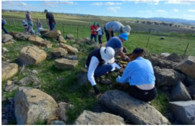
ALL EYES WERE TOWARDS THE GROUND AS EAGER FOSSICKERS LOOKED FOR SPECIMENS TO TAKE HOME