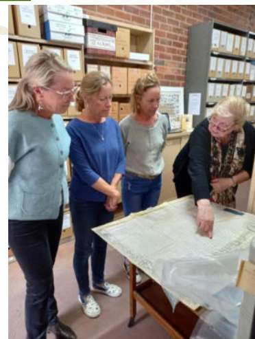
VISITORS AT THE ARCHIVES OPEN DAY BEING SHOWN A DOCUMENT IN OUR COLLECTION.

The mid-morning service took place in glorious autumn sunshine with a very large crowd in attendance at the Soldiers Memorial Hall. The society members paid their respects by laying an arrangement of flowers to commemorate those who served and lost their lives during times of war.