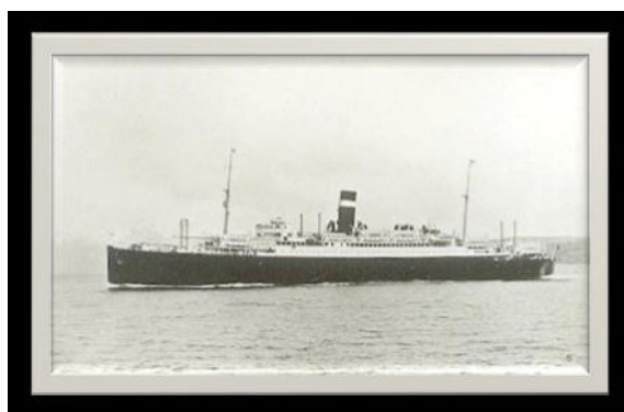
The TSS Empire Brent

I recall a long bus trip to get to the place where our ship the TSS Empire Brent was moored in Glasgow, Scotland. The ship carried 965 passengers who were migrating to Australia for a new life in a sunny land with strange animals.