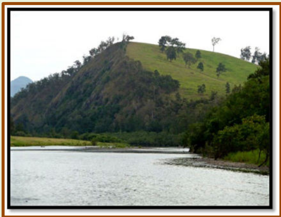
Macleay River looking towards Nulla Nulla Creek