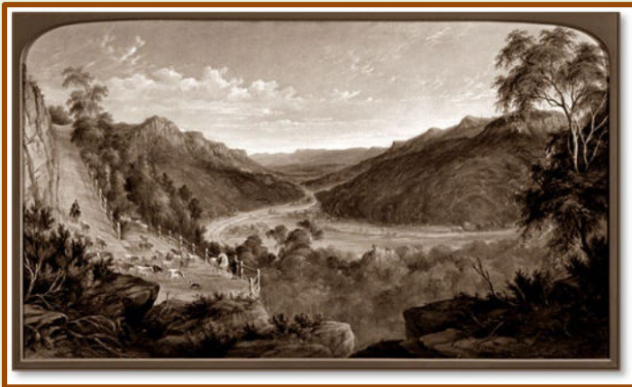
Burragorang Valley near Picton, 1879, by James H Carse (1818 – 1900).

Burragorang Valley now lies beneath Warragamba Dam but before it was flooded it was beautiful, unchanged native bushland teeming with wildlife, aboriginal rock carvings, three rivers and towns, which were home to about 3000 people.