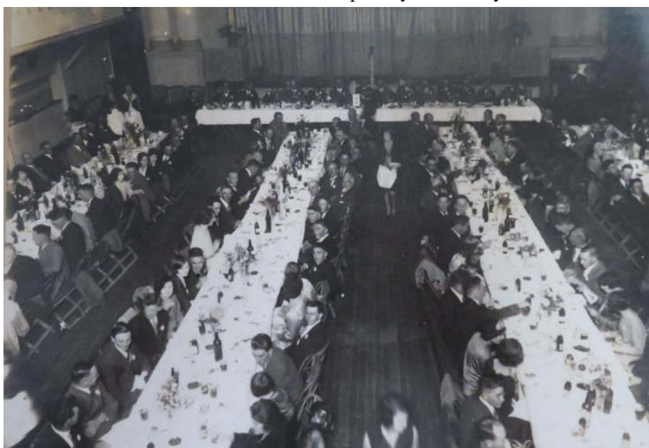
"Pull Together" dinner at Olympia Theatre, Scone 1930