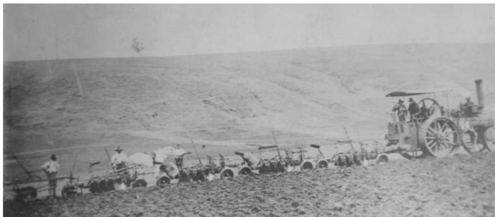
Traction engine pulling multiple ploughs.