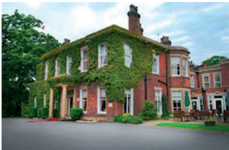
Farington Lodge Hotel, Leyland, Lancashire Venue for Society 50th Annual Lunch