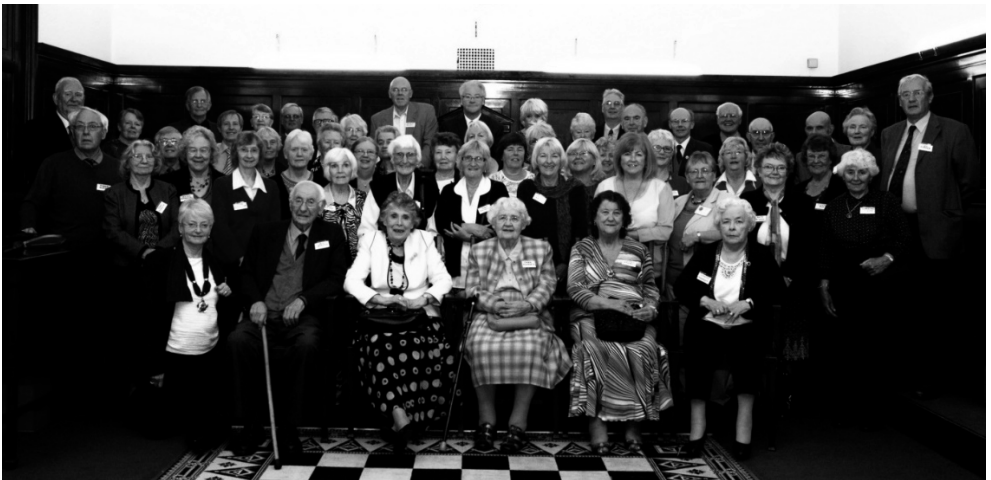
40 TH ANNIVERSARY DINNER GROUP 2013

A standing order form to renew membership has been printed again, in time for anyone wishing to change their method of renewing membership to set up with their bank or building society. Of course, the usual methods can still be used, cheque or via the website. Don't forget to put your membership number as reference after your name.